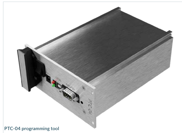
PTC-04 programming tool

Communication is done through a standard RS-232 null modem cable to a COM port of the PC or via USB. The PC requires no custom configuration, allowing the programmer to be used with any PC with a COM port speed of 115.2kbs or a standard USB 1.1 or USB 2.0 (Type A) interface.